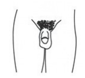
I will have hair near my privates